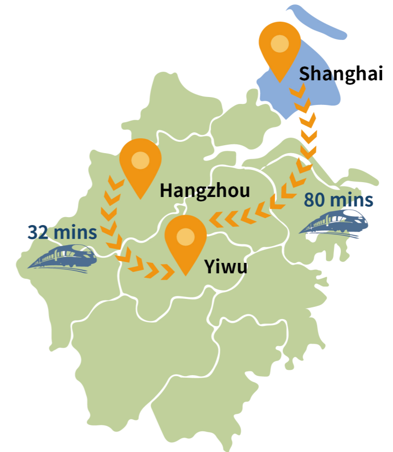
Located 130 km from Hangzhou, 300 km from Shanghai