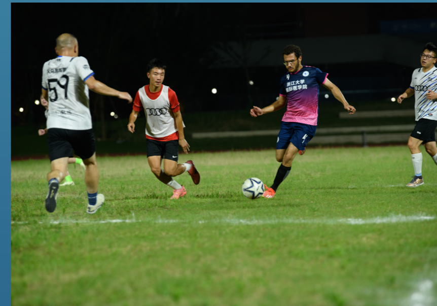
Football Match Organized by the Sports Club