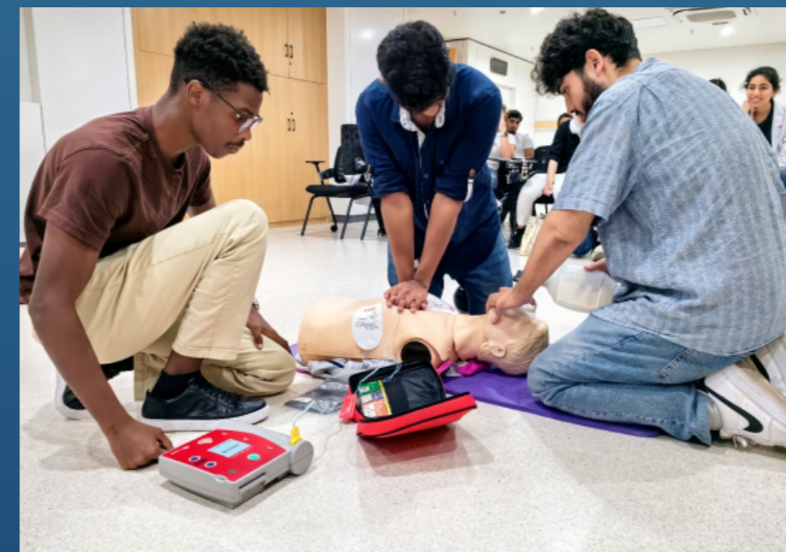
Cardio Pulmonary Resuscitation (CPR) Training